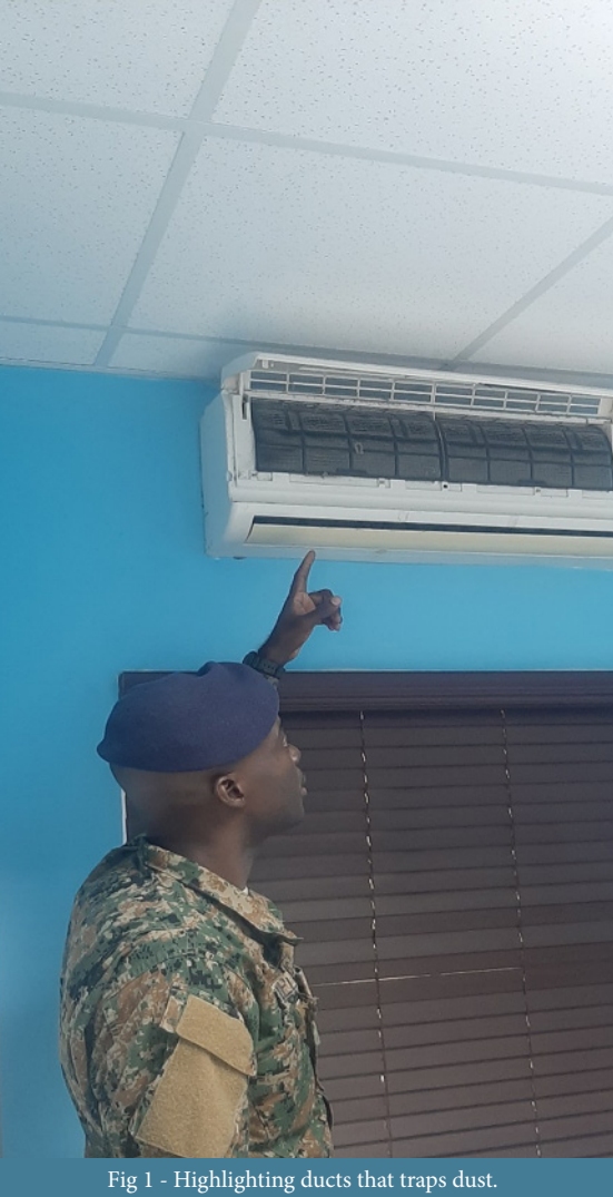
Fig 1 - Highlighting ducts that traps dust.

The maintenance of good Indoor Air Quality (IAQ) inside offices, workplaces is important not only for workers' comfort but also for their health. Poor IIAQ has been linked to symptoms like headaches, fatigue and irritation of the eyes, nose and throat. Prolong exposure to pollutants have been linked to diseases that leads to cancer and even death.