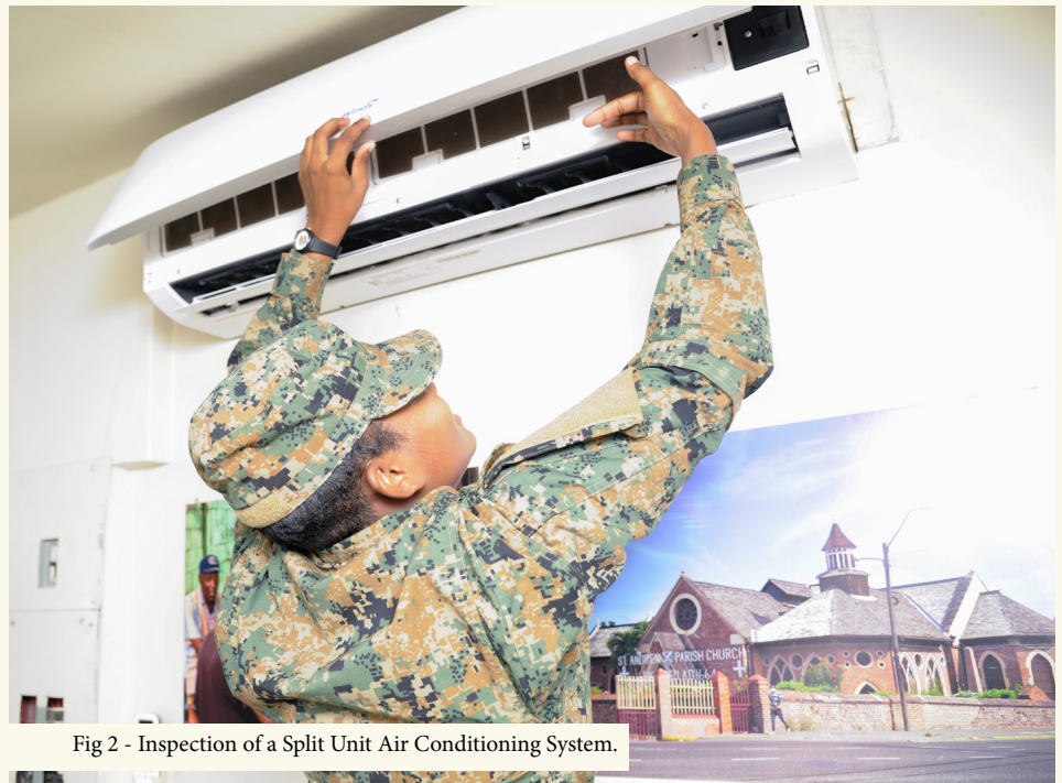
Fig 2 - Inspection of a Split Unit Air Conditioning System.

The Public Health Department recommends the cleaning and general maintenance of split units every quarter and a log sheet placed within the office space with the servicing dates. The general cleaning and maintenance of a Central Air Conditioning System would be every five (5) years.